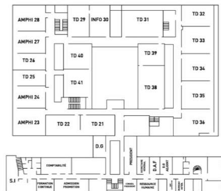
PASCAL 1 - 1ER