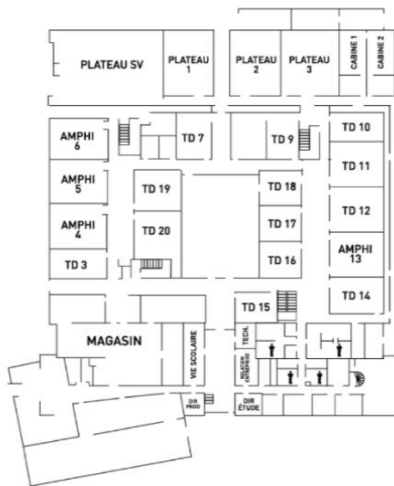
PASCAL 1 - RDC

A multi-purpose space, at the heart of student life and artistic projects.