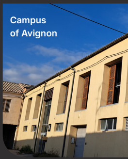
Campus of Avignon